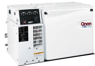
Onan Optional Sound Shield Model pictured has optional gauges